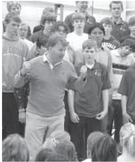
Barbershop Extravaganza 2008