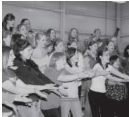
Barbershop Extravaganza 2008