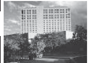
The Grove Hotel