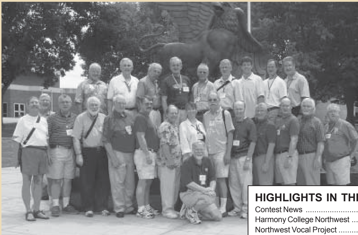
Evergreen District Attends Harmony University