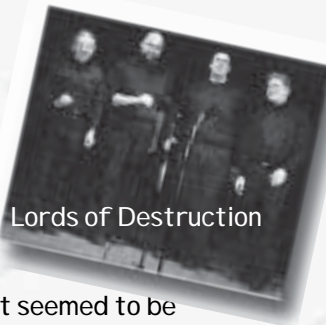
Lords of Destruction

From the point of view of the organizers, this event represented a growing spirit of cooperation between Society and S.A.I. chapters, including the Pride of Portland and Columbia River SAI Choruses, and the Rose City Timberliners, Vocal Gentry, Bridgetown Sound and Tualatin Valley Harmony Masters Barbershop Choruses. This was truly an event for the successful "promotion and encouragement" of the love of harmony singing in our young people.